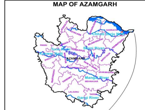
MAP OF AZAMGARH